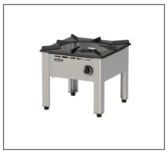
Due to continuous technical development, the image shown may not represent the latest design of the unit.